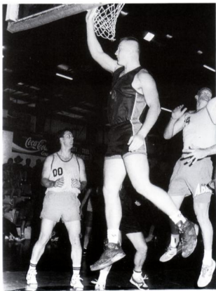
Who says white men can't jump