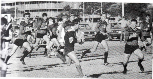
A Wests player running into a Red and Black road block.