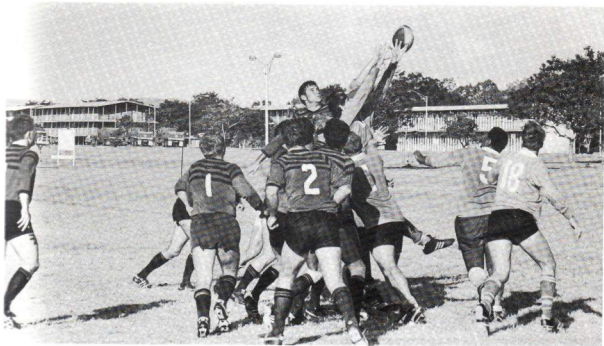
2/4 RAR v Eastern Barracks.