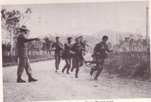
The middle - who's the chap without rifle and gear?