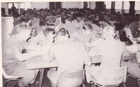
Pssst! How many stubbies does a Charlie Swede hold.