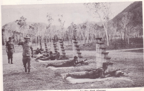
The end - Is there a reason for the dark glasses.