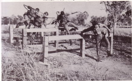
A Coy. - Giving Charlie efforts a fright