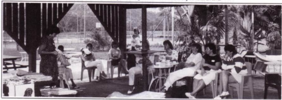
Ladies Association getting together