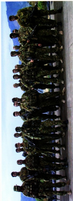
Tops: CS 23 Ppl Jun to Jul 01