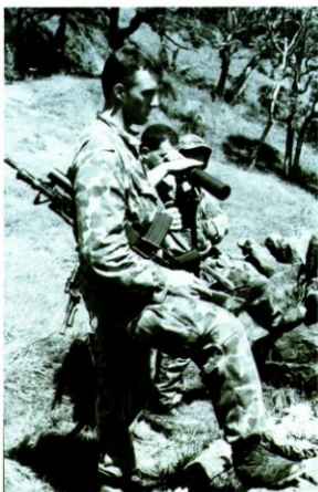
Conducting observation from Everest