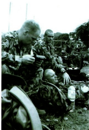
Early days and rude haircuts