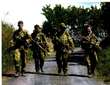
CS 21 'reservoir dogs' foot patrol Maliana Jul 01