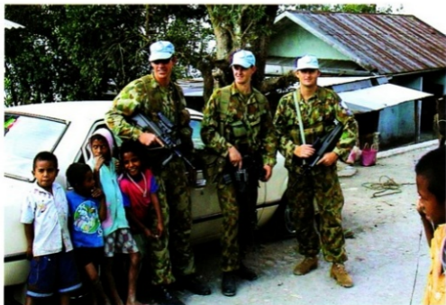
CS 22 foot pit Bobonaro