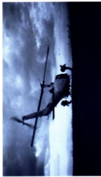
Clockwise from top: Fort Bolsonero, Pti with the locals, Huey insertion, Looking over the Maliana basin from Everest