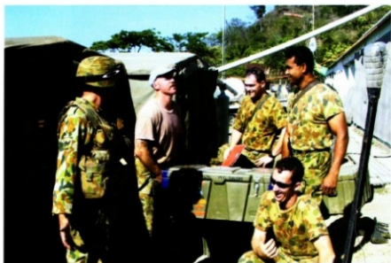
Q pers preparing for redeployment