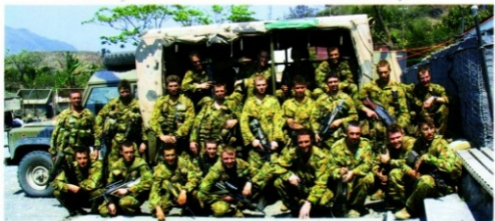
CS22 Ptl departure Sep 01