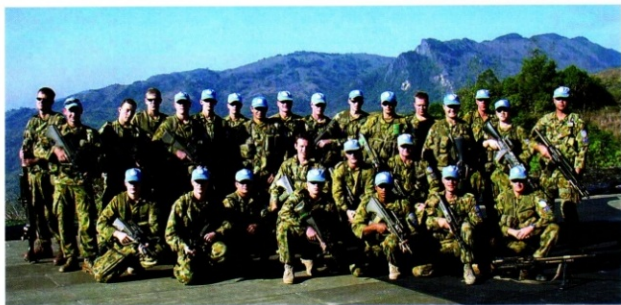
CS 21 FOB security Aug 01