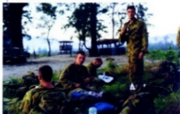
CS22 OP Titon 1 Jul 01