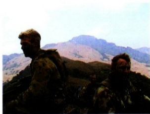
CS 21B Ptl Saburai track Sep 01