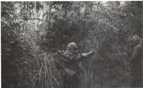
Is this TOPP 2 or TOPP 3