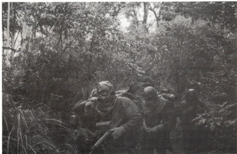
Coy HQ — who are they?