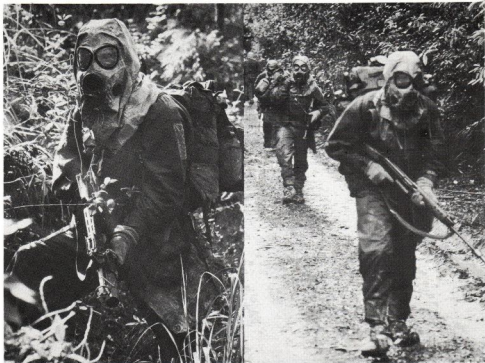
A Coy on patrol