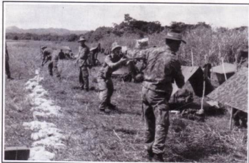
Mission Impossible - distribution of rations

On 10 June the company provided a military display