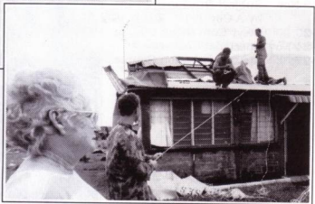
The lads at work