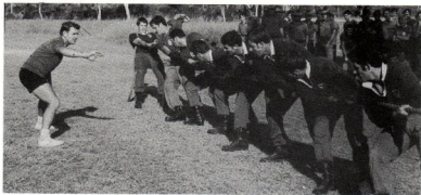
The CSM with his lightweight Tug-O-War team