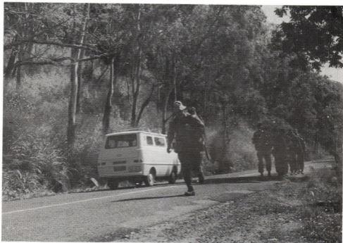
Sig Pl route marching at Mossman. Sgt Bernhardt shows the way

At the risk of a "Beadwindow" the exploits of the Signal Platoon this year are numerous. The main emphasis of training has been on High Frequency radios with mixed success. We are happy to have roped in so many other members of the Battalion in chasing the elusive E and F layers. It's all good fun isn't it chaps? Anyone finding the F layer at 0300 hrs on any day is asked to report it to the RSO ASAP.