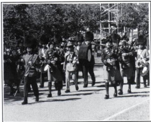
Pipes and Drums march on Anzac Day

Next year we are assisting the local Pipe Bands with playing positions within our P/D's. The