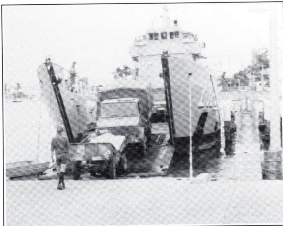
Tpt Pl practising deployments on HMAS Tarakan