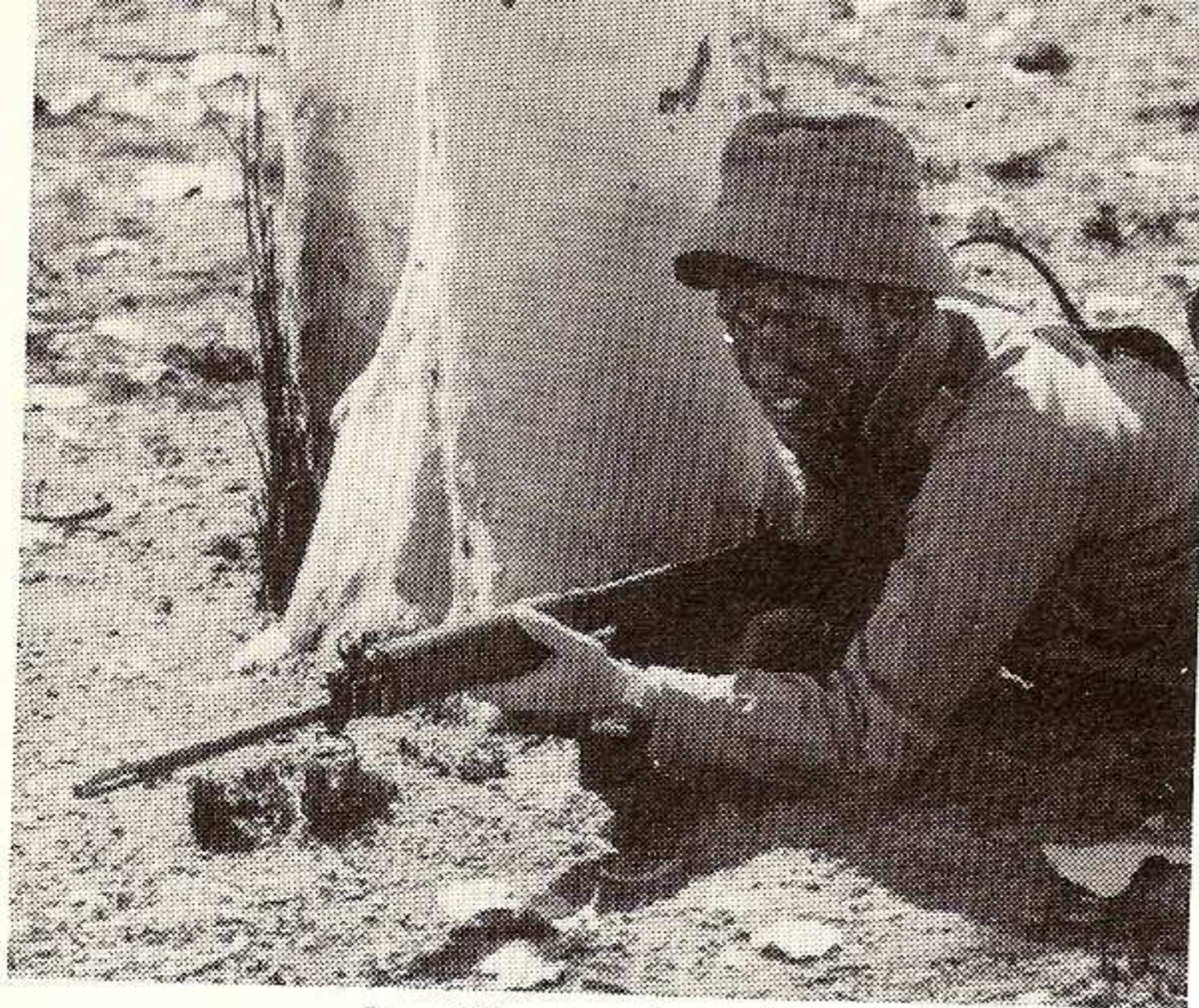
Road Runner in action.