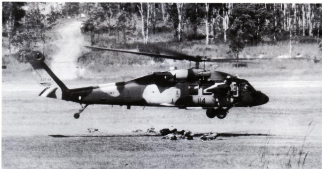
SPE Training at High Range