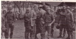
Members of Spt Coy at HRTA during field firing training