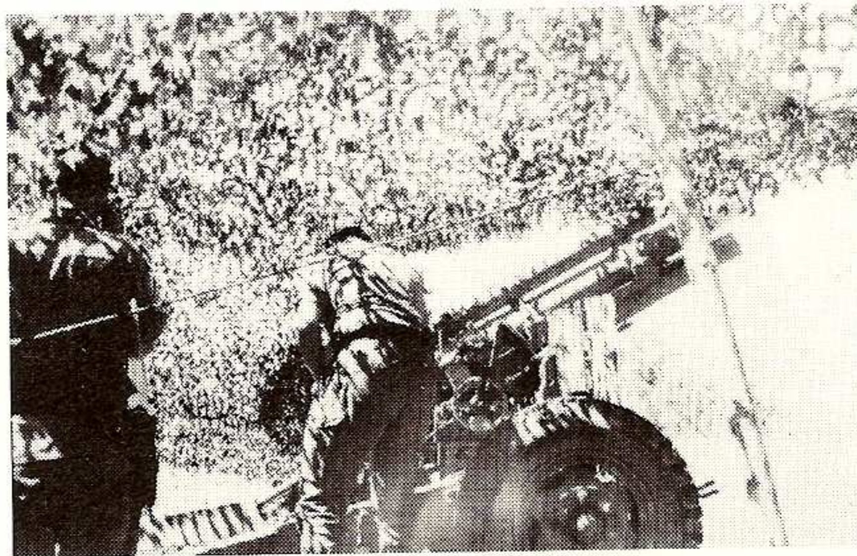
108 Field Battery firing in direct support.

The exercise made soldiers more aware of operational conditions, the importance of command and control at all levels and the various forms of fire support which an Infantry Battalion can expect to receive and the effect of which these types of fire support have.