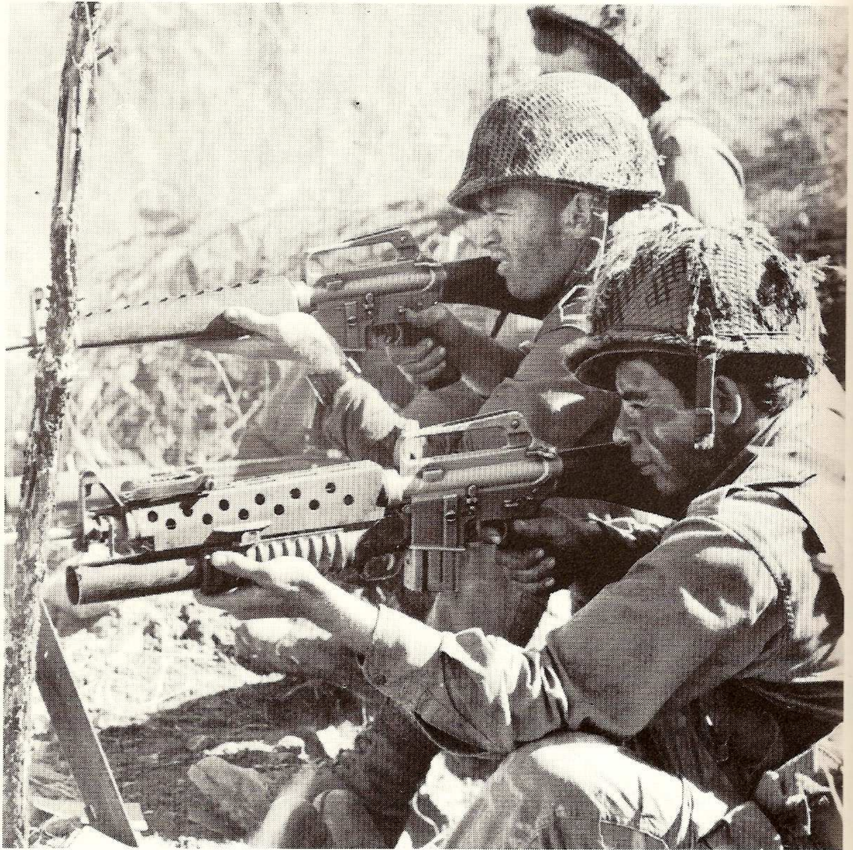
Firing at 'Musorians' forward of the defence perimeter.