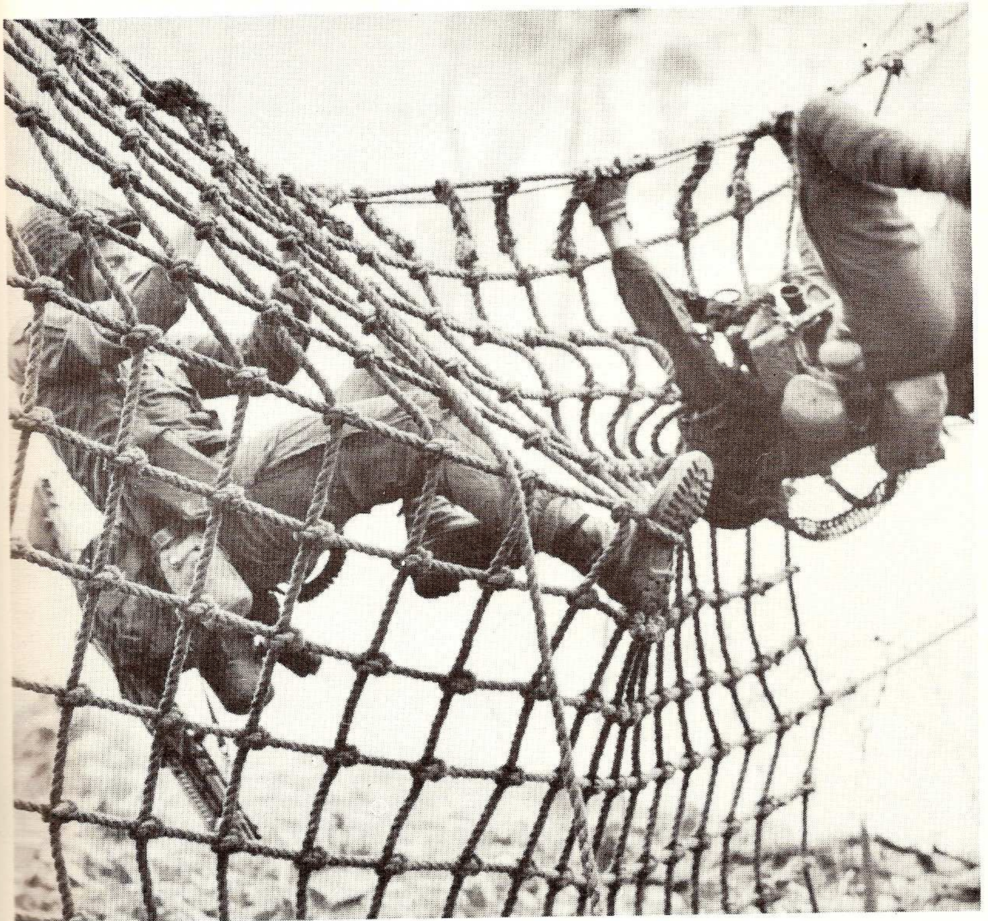
Negotiating a cargo net during the battle inoculation course.