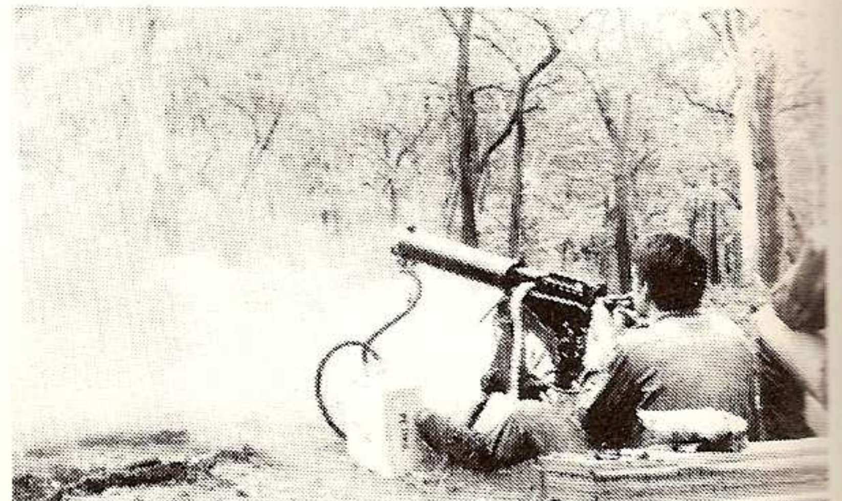
An MMG (Vickers) firing overhead fire on the battle inoculation course.