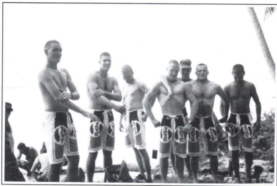
8 Sect 6Pl "The Pepsi Boys" - Life's a Beach in New Britain.

As the year draws to a close, we look forward to success for those lucky enough to be on a course. One particular hope by all members of the platoon is that the bouts of malaria that have been taking their toll will finally cease.