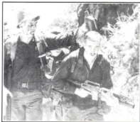
"A little help from my friends"

Courses have yet to influence the manning on this platoon, but the team should stay pretty much the same. Roll on 1988.