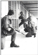
OC's room inspection