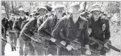
5 Platoon on the move