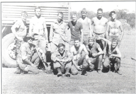
Bravo Company Limited Incorporated