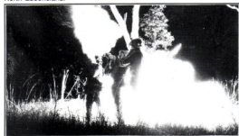
B Coy by night

It was flat strap after April and by this time we were all super fit and right on top of our weapon handling and field craft. Then we learnt that Major Gregg was still our OC (he'd just been jet-setting somewhere) and back to the field we went. Exercise Eager Eaglet was probably the best we've ever had. In and out of APC, caribou, UH1H helicopters, trucks and of course a good slog of walking. We covered a huge area of land and we practiced warfare in the desert, towns and the jungle mountains of North Queensland.