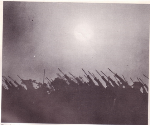
The culmination of the parade was the firing of volleys, followed by the memorable flag lowering ceremony. The sun set was fitting finale to the parade.

Mention must also be made of the units which so able supported us, namely, B Sqn. 3 Cav. Regt. for providing APCs to hold ground and 108 Fd. Bty., 4 Fd. Regt. for firing of volleys. Both, together with the Pipes and Drums added greater colour, and interest, complementing well the efforts of the platoons on parade.