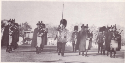
The Pipes and Drums at last at full strength and ceremonially kitted lent further impact to the spectacle. Beating the retreat went without a hitch and focussed the spot light on their professional ability and showmanship.