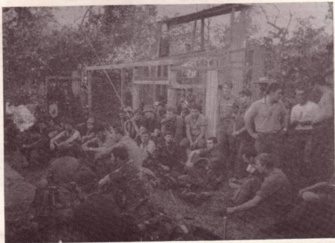
Ex Coral Dagger "Brothers of God"