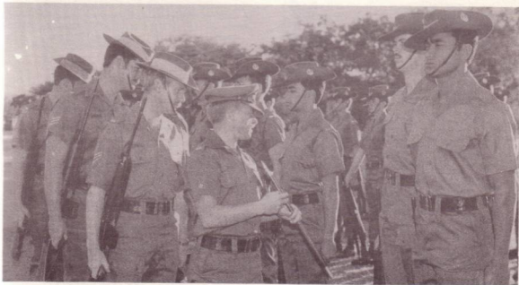
CSM C Coy Belt Inspection

Needless to say, with everything C Company had tackled so far this year, Swift Eagle proved no problem. Plenty of 'go-getum' aggression, some 'startling' tactical appraisals, some heroic action in battle, some death defying acts of ingenuity and lo and behold, another exercise bites the dust.