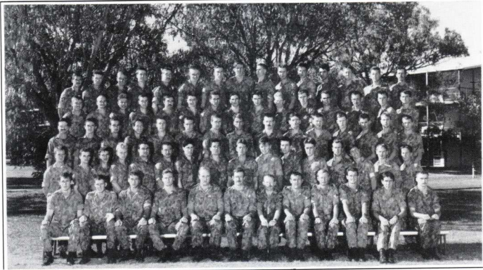
A Coy 1989